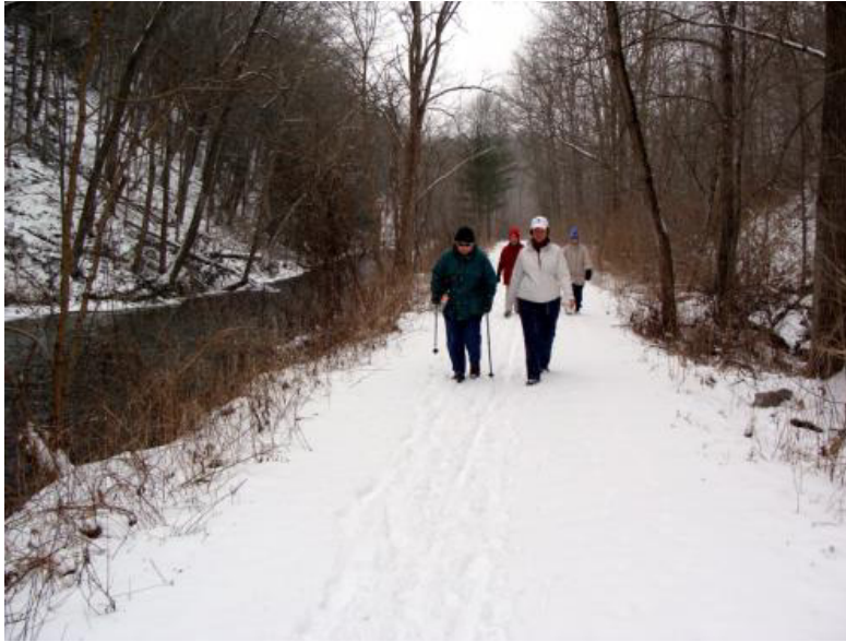
Winter scenes on the Outlet Trail.